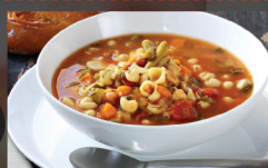
羅宋湯 Borscht soup