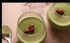
抹茶紅豆奶凍 Matcha mousse