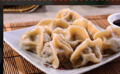
韓式素菜餃子 Korean veggies dumplings