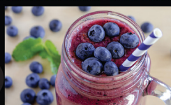
藍莓菠菜沙冰 Blueberry spinach smoothie

要獲取更多食譜，可瀏覽 SCOTT 專頁 www.scott-gear.hk Please visit www.scott-gear.hk for more homemade recipes.