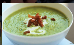
西蘭花牛油果忌廉湯 Broccoli avocados cream soup