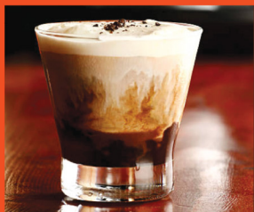
Baileys Irish Coffee